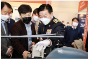
Purchase meeting with Korea Coast Guard Export meeting with overseas buyer & International Coast Guards